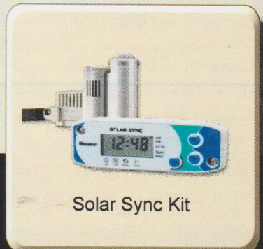
Solar Sync Kit

to “learn” how much water all your plants need. These types of systems can save thousands and at some larger landscapes hundreds of thousands of